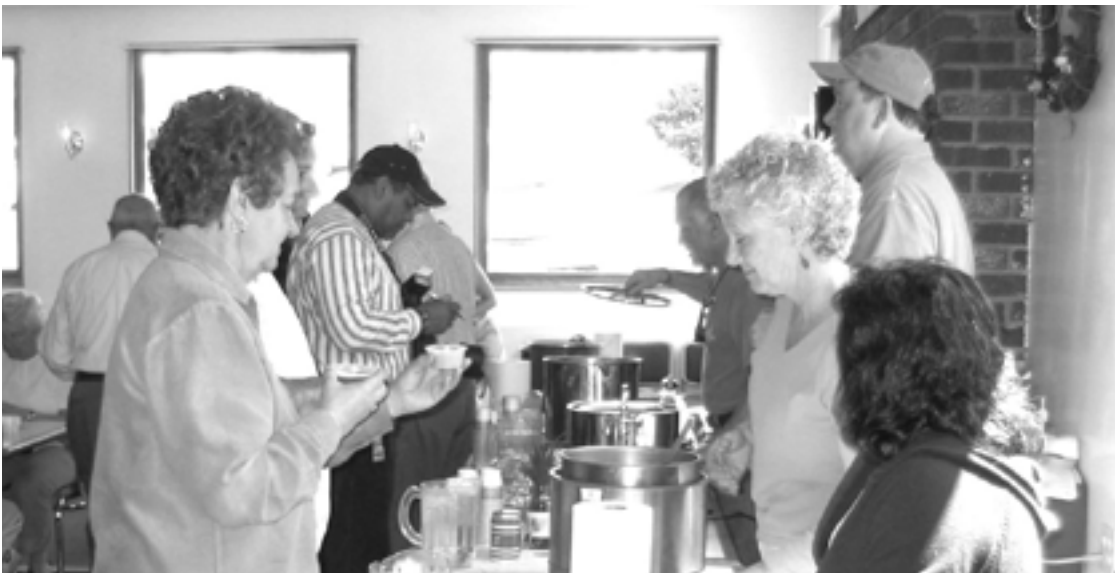
'Chowder Heads' at the 2008 Chowder Cookoff. Will you join our 'master chefs' on February 8th for the 2nd annual LCCC Chowder Cookoff? See page 4 for more details.