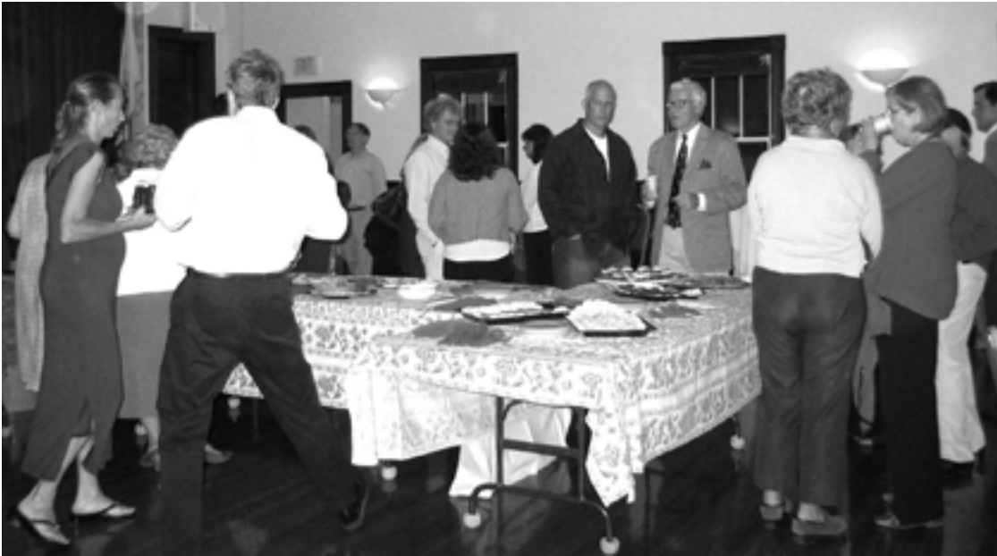
Fall Fest Desserts at the LCCC